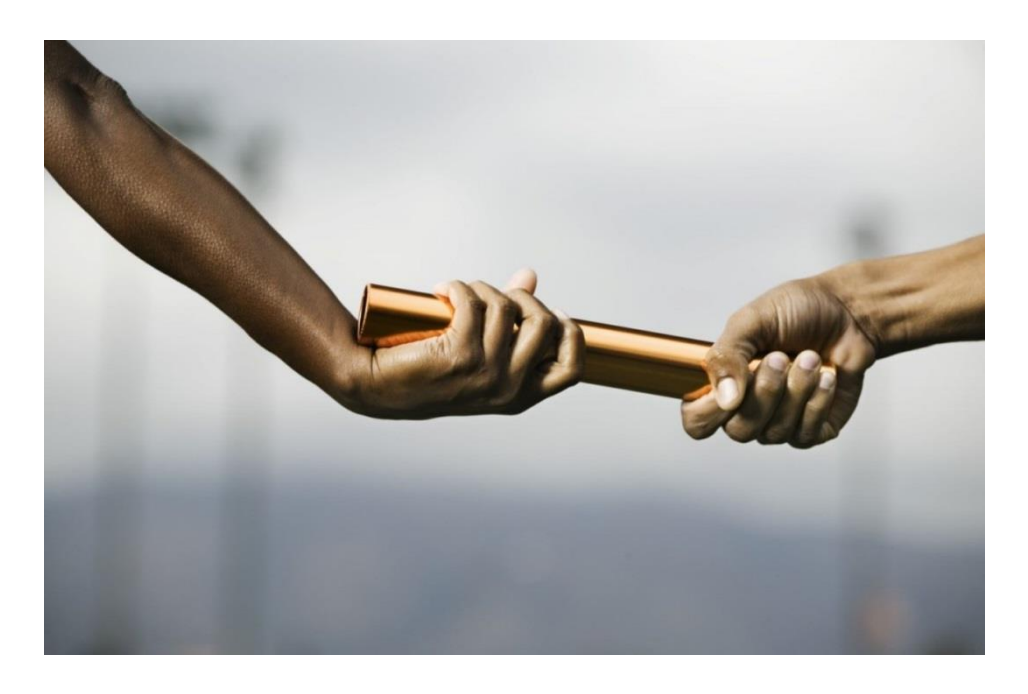
Congratulations and best wishes to this year's winner from the team at Ethical Tissue